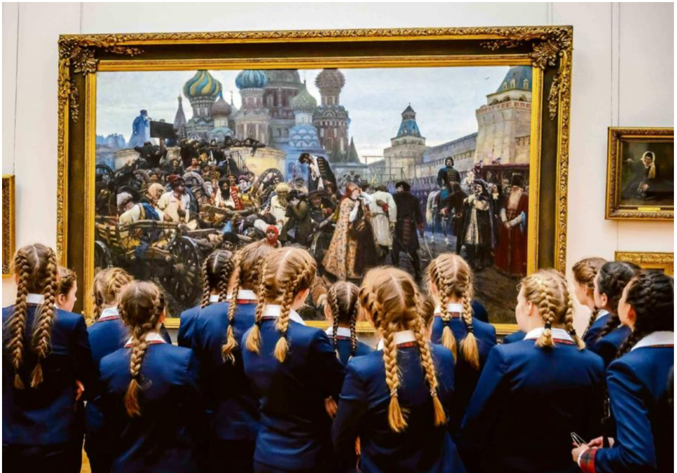
Tretjakov Gallery museum, Moscow. Visiting school class fascinated by the famous Soerikov (1881) painting depicting the execution of the Streltsy group while czar Peter the Great watching.