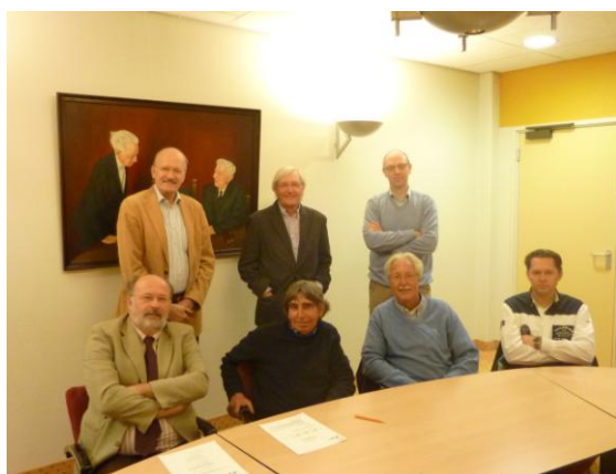
Hospital meeting 16 April 2012 at the Scheper Ziekenhuis Emmen (SZE). from L-R standing: 1,5,3 from L-R sitting: 2,7,4,8